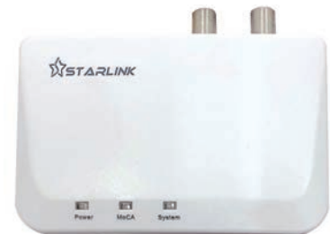
MN2550 MoCA 2.5 Network Adapter