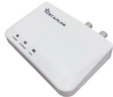
MN2525 MoCA 2.5 Network Adapter