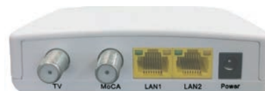
MN2550 MoCA 2.5 Network Adapter